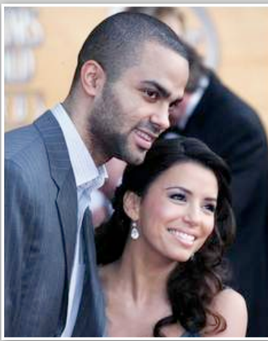
NBA player Tony Parker and actress Eva Longoria are among the couples who have scheduled a July 7 wedding.

Still, there's a practical reason behind their choice too (which they made all the way back in 2005).